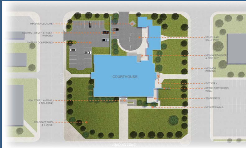
Courthouse Site Plan

Courthouse and Carbon Building Improvement Project