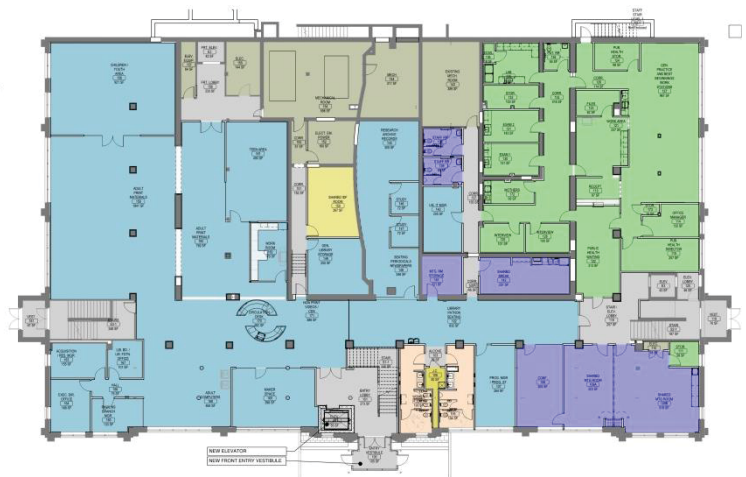
1 FIRST FLOOR DEPARTMENT PLAN