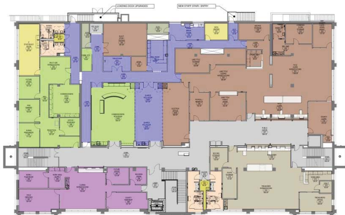
1 SECOND FLOOR DEPARTMENT PLAN